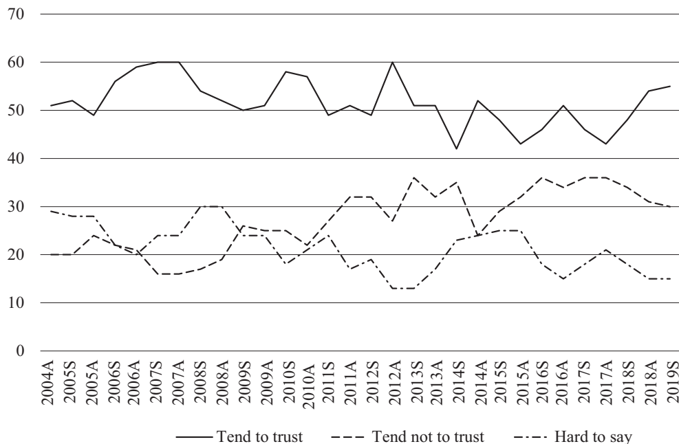
Diagram 2. Trust of Poles in the European Parliament in the years 2004–2019

Source: Own study based on Eurobarometr data (A – autumn, S – spring).